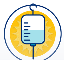
chemotherapy toxicity risk

By the end of the session, you will understand which tools are most appropriate for use in clinical trials and how geriatric assessment can help ensure that studies are more inclusive of older adults.