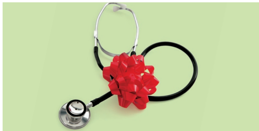
Gifts reconsidered: Some doctors are now speaking out against the new rules

The call for conflict of interest reform has been spearheaded, in large part, by Senator Charles Grassley, the ranking Republican on the Senate Finance Committee and cosponsor of a bill that would require drug and device makers to report any money paid to doctors that exceeds $100 a year. "The issue for me